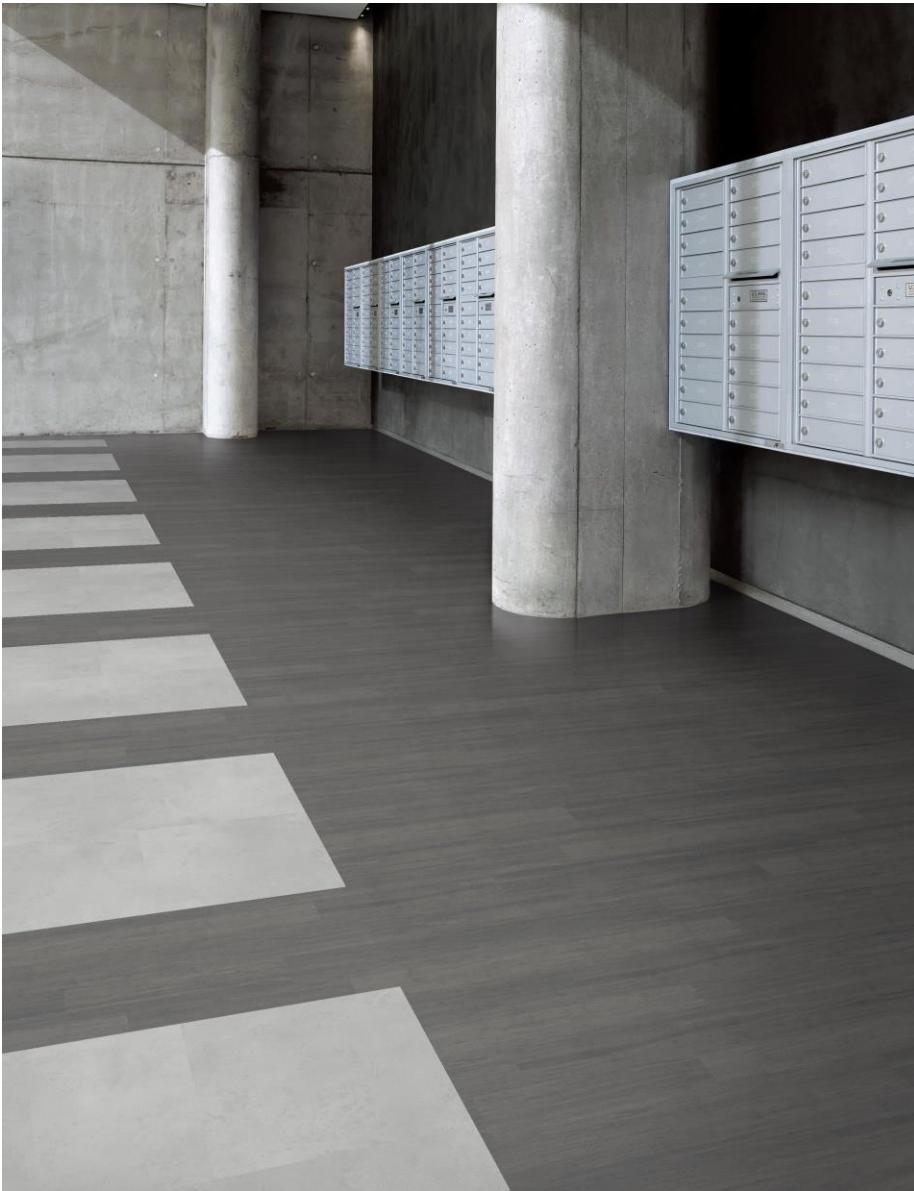
3 MM LVT Luxury Vinyl Tile